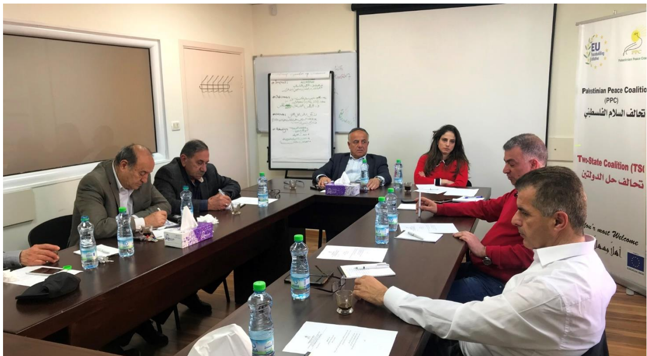
TSC meets with local leaders, influencers and journalists. Ramallah 2019

In a joint Palestinian-Israeli effort, members of the TSC have met with various local and international stakeholders to amplify our message and to garner more support for the two-state solution. We jointly called for more involvement of these influential actors and tirelessly explained the pressing need for a genuine peace process to save the two-state solution. During 2019, we met with decision-makers, international and regional diplomats, senior journalists, local community leaders or figures, members of the Palestine Liberation Organization (PLO), and members of the Israeli Knesset.