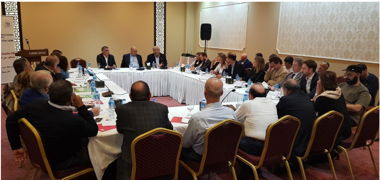
TSC Political Capacity Building Seminar, Ramallah 2019

.... and other questions related to public opinion about peace, internal reconciliation and the two-state solution.