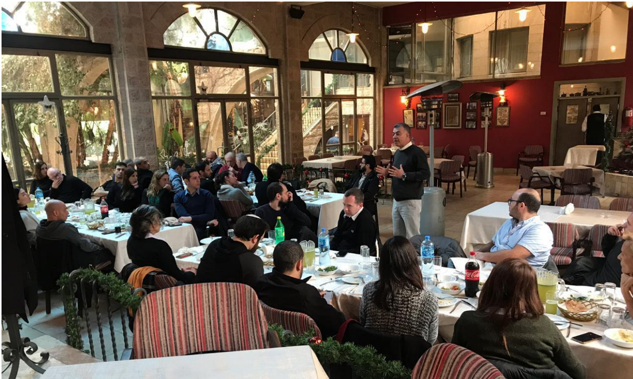
Hosting a delegation of Israeli journalists and analysts in Ramallah, 2019.

Our efforts to bring the two-state solution into the public discourse included receiving two Israeli delegations in Ramallah, which included Israeli journalists and influencers, political analysts, parliamentary assistants, and leaders of Israeli youth groups. The TSC organized meetings for them with senior PLO and PA leaders, in addition to leaders and representatives of Palestinian youth groups. Some of the Israeli journalists shared their experience in Ramallah with their own audiences; they wrote articles , posted to their facebook pages and tweeted .