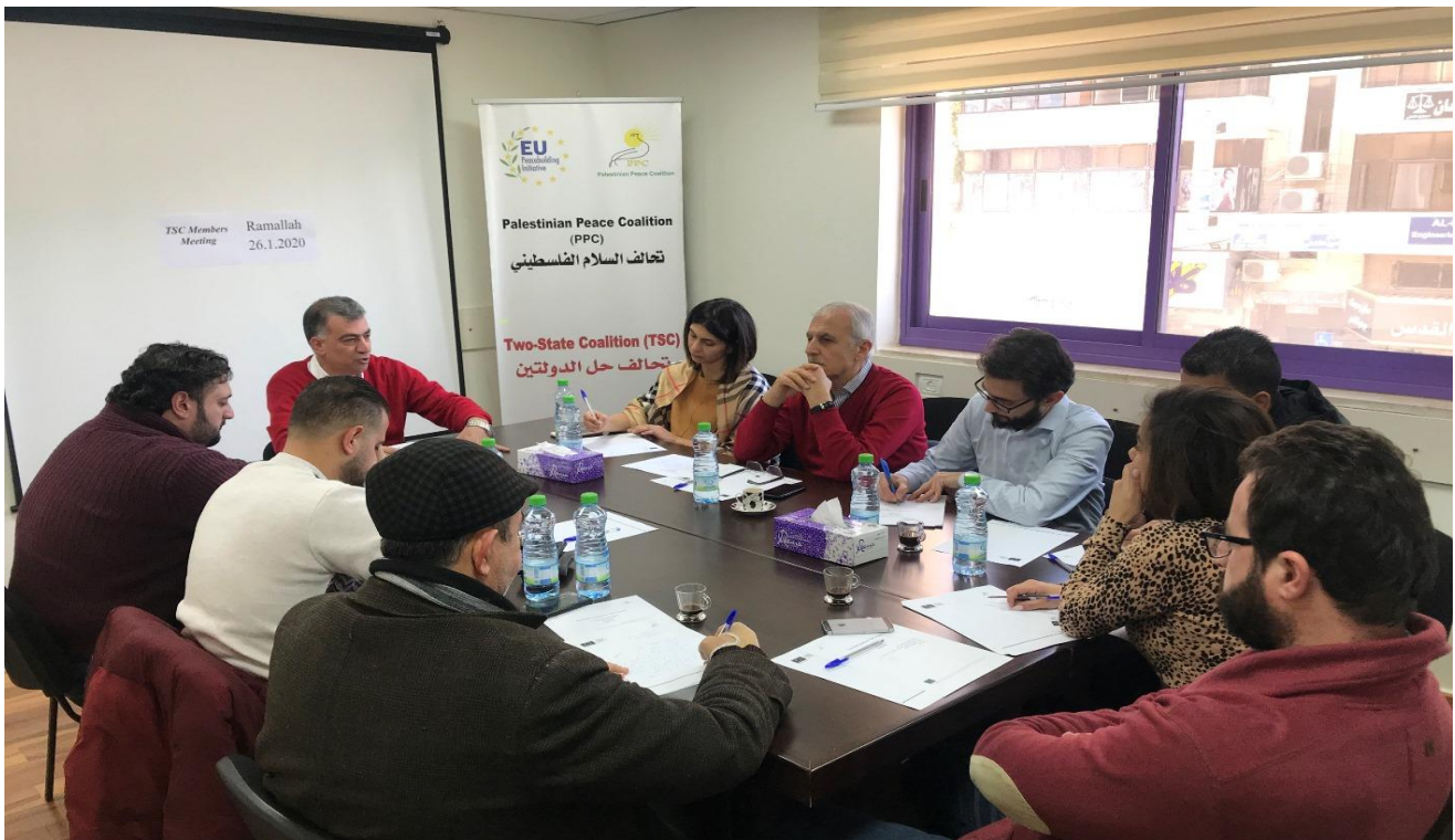
TSC members meet in Ramallah early 2020.

The TSC local activities in 2019 included regular meetings for members of the coalition, capacity building workshops and seminars, field visits and meetings with local authorities and actors, in addition to a number of consultation meetings organized specifically for the secretariat of the TSC. We brought together more than 30 representatives of the member organizations, moderated discussions on the status and future of the two-state solution, and hosted urgent meetings to assess the latest political developments that have direct impact on the parameters of the solution. These meetings have helped us identify, highlight and evaluate the actual impact of the various factors affecting the public's attitude towards peace and the two-state solution. Together with other members of the coalition, we discussed best practices, shared lessons learnt and devised the best strategies and tactics in order to reach a wider audience for peace and stability.