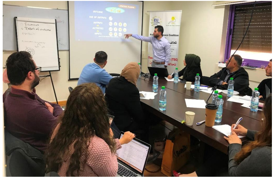
A capacity building workshop for the TSC members on online advocacy. Ramallah 2019

How can we reach more people? What tools should we use? Which platforms? And how can we assess our actual impact on the constituencies, and, equally importantly, how can we increase and improve our ability to advocate for the two-state solution? These are the main questions we addressed throughout this year's capacity building seminars and workshops. We believe that for the TSC to have more influence on the public on both sides, members must have the needed tools/skills to be able to influence their own constituencies.