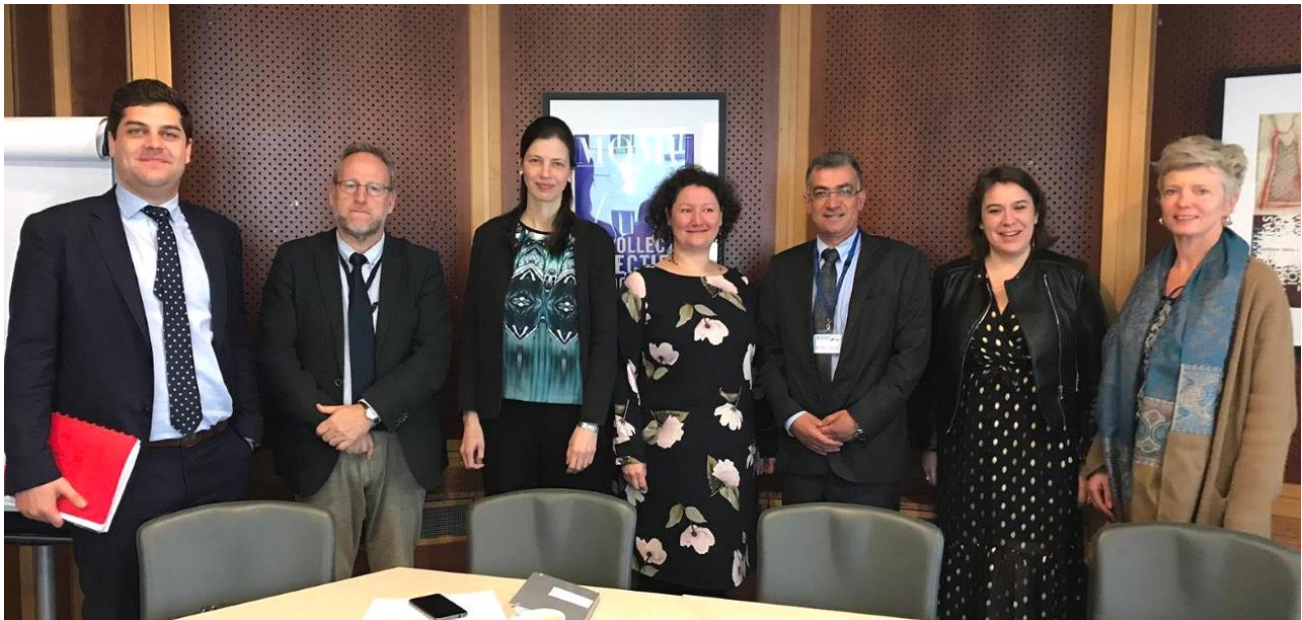
Meeting with international stakeholders, Brussels, 2019