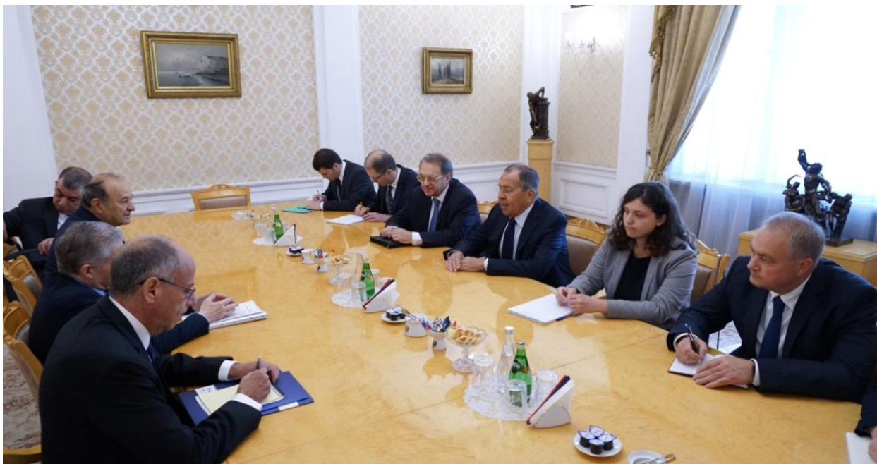
Meeting with Mr. Lavrov and his team. Moscow, 2019

This year, we met with the Russia's FM Sergey Lavrov in Moscow. This meeting was covered by various news outlets in Palestine and in Israel, as well as in Russian , in addition to social media networks.